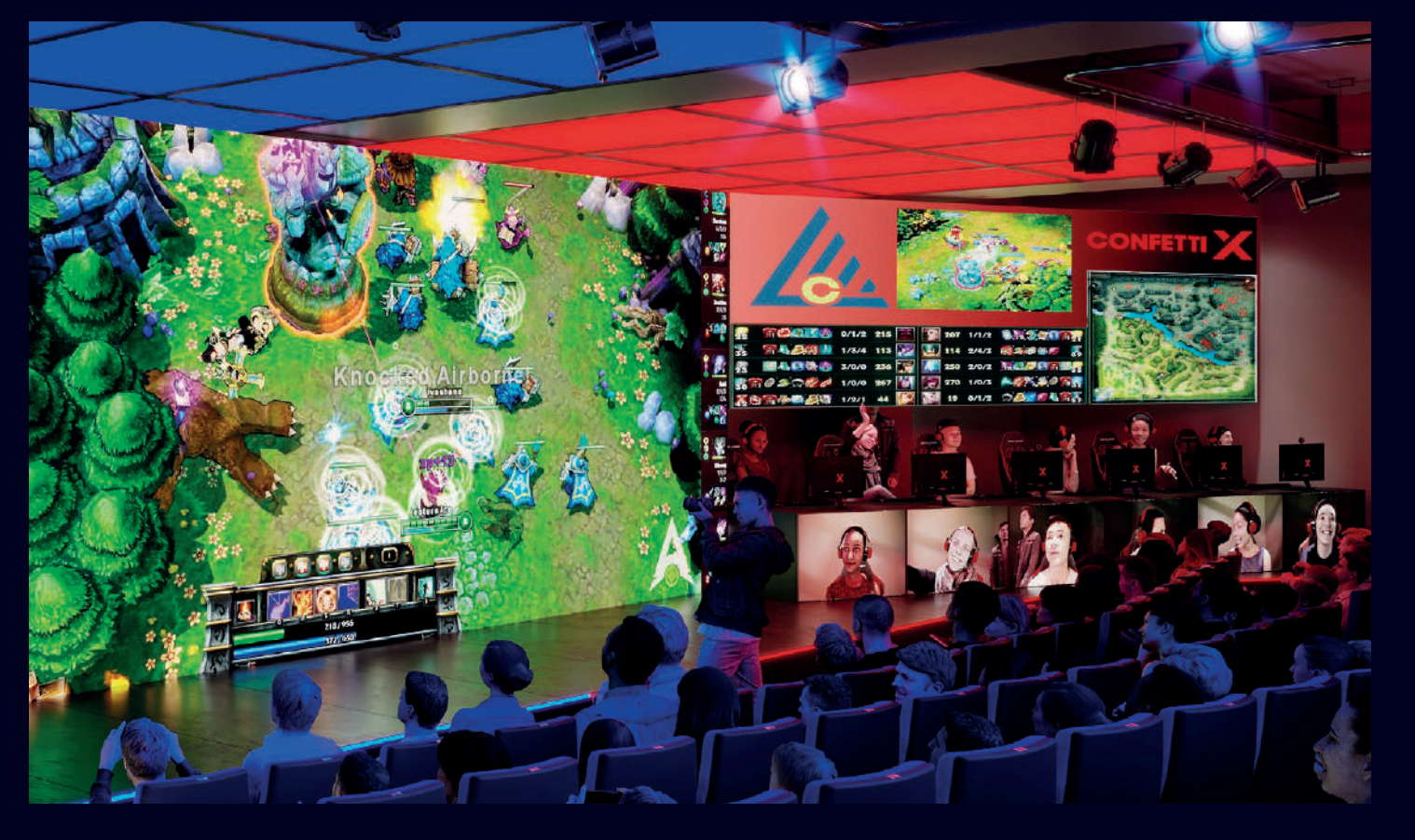
Confetti X stage